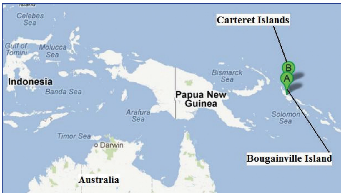
Image adapted from www.maps.google.com