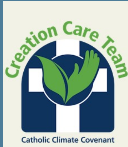
Creation Care Teams