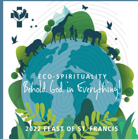
Feast of St. Francis