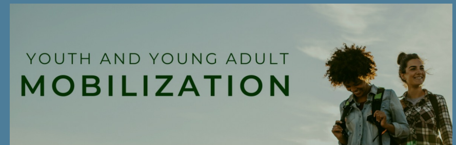
Youth and Young Adult Mobilization