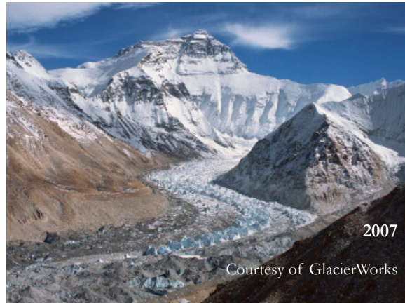
Main Rongbuk Glacier (see inside page)